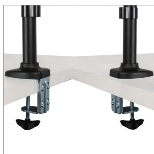
Supplied with a desk clamp that can attach either to the rear or side of a desk or through a grommet hole