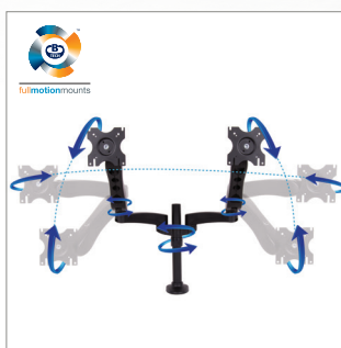
Full motion adjustability allows easy screen positioning for the perfect display