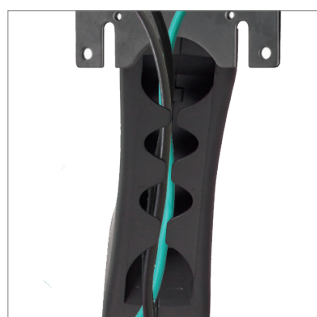
Cable management is integrated throughout the mount for a neat and tidy installation